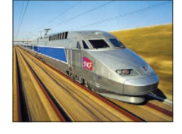
High speed train image courtesy of Moroccansands.com.